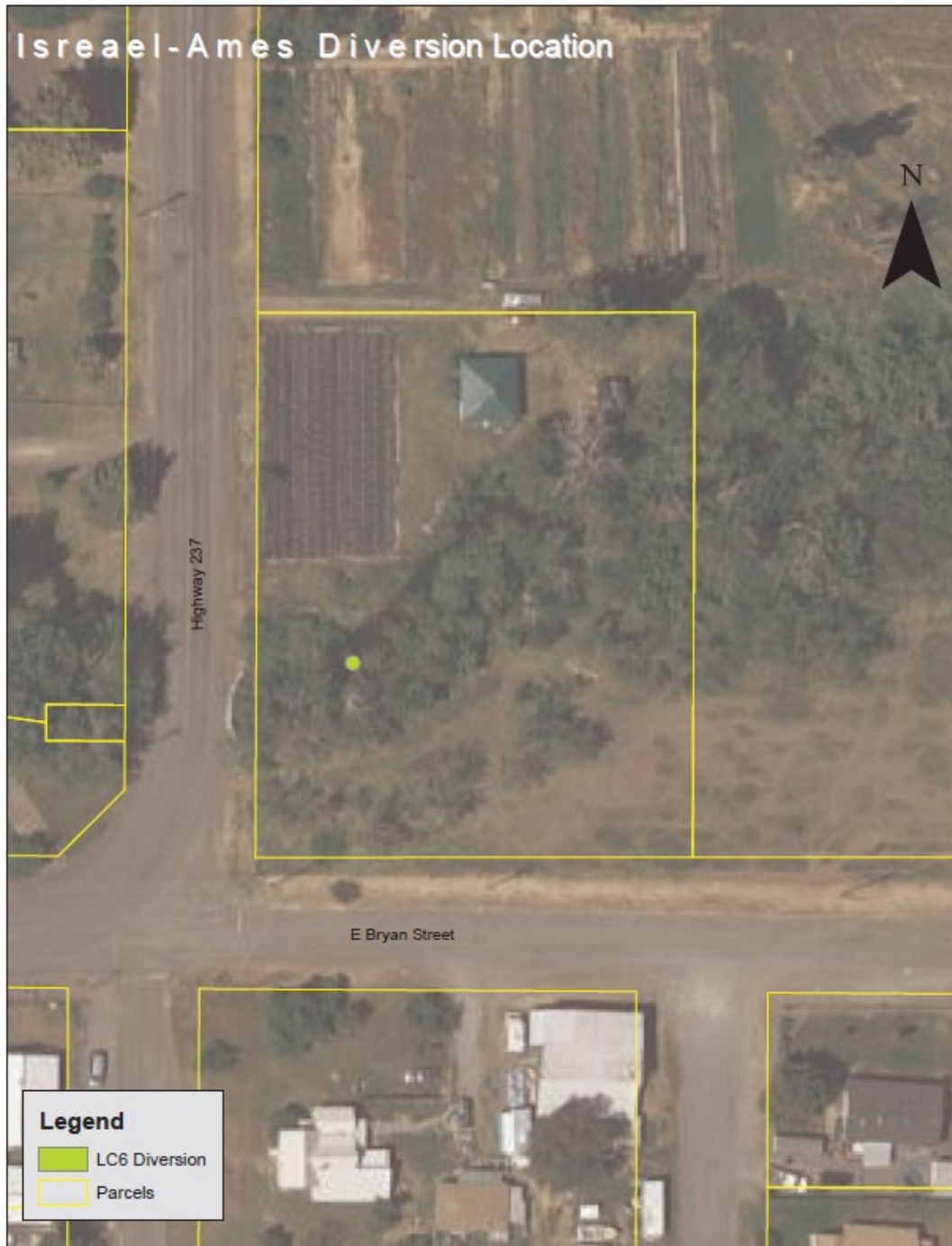
Exhibit A – Map of Owner Properties