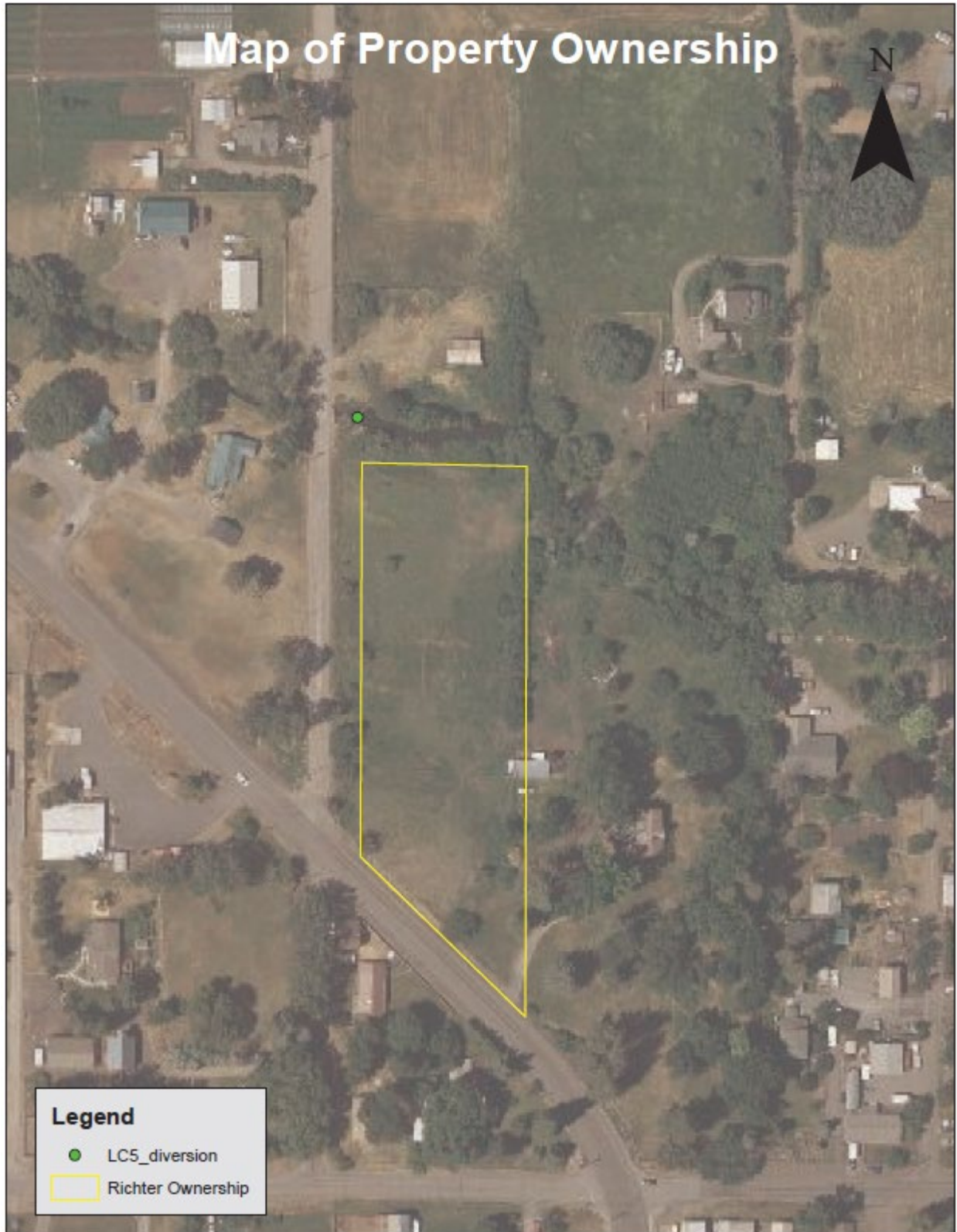
Exhibit A – Map of Owner Properties