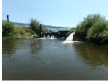
Elmer Dam fish ladder providing passage.JPG