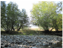
Secondary Channel SC1 Inlet.JPG