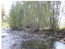
Main Channel MC2 Return.JPG