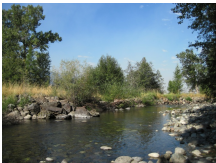
Secondary Channels SC2 & SC3 Inlets.JPG