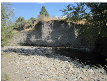
Channel Fill & LW Placement.JPG