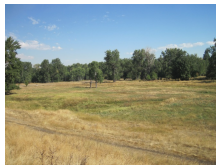
Looking East Over Existing Wetland.JPG