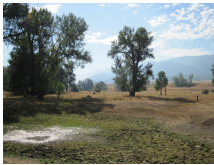
Secondary-Main Channel SC & MC2 Confluence.JPG