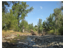
Main Channel Split.JPG