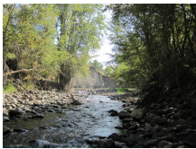
Main Channel MC1, Looking Upstream.JPG