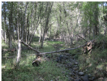
Main Channel MC2.JPG