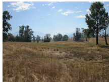
Secondary Channel SC2 & SC3 Confluence.JPG