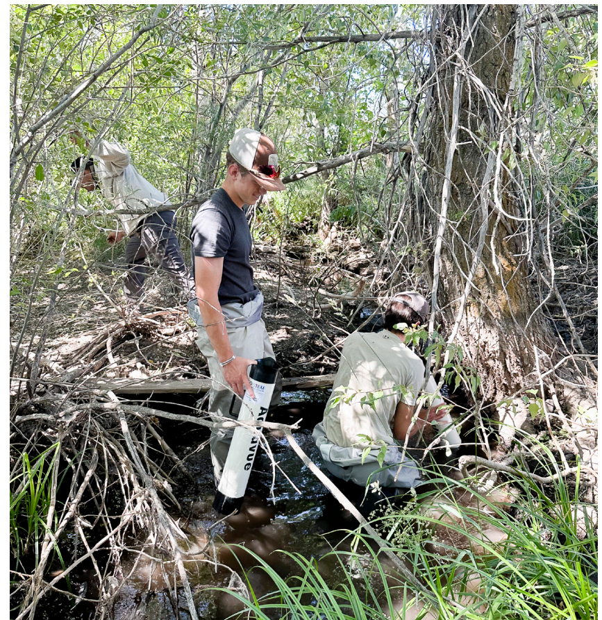
The interns use underwater viewing tubes to determine if freshwater mussels are present.

GRMW: This experience was made possible by the Training & Employment Consortium (TEC) and the Eastern Oregon Workforce Board based in La Grande, OR. They oversaw the application process, hired, and paid the wages of our interns. This internship would not have been possible without their great programs. For more information visit tecteam.org and eowb.org . ■