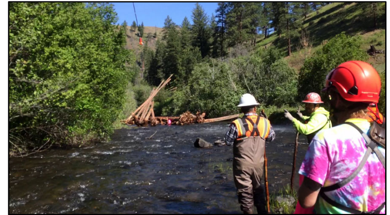
Helicopter placing large wood jam structures

FISH RESPONSE: Targeting limiting factors such as temperature, in-stream habitat conditions, and sediment loads will achieve immediate benefits to salmon. Long term benefits will be realized through a focus on restoring fluvial habitat-forming processes, floodplain and groundwater hyporheic connectivity, riparian and wetland plant communities, and instream complexity and diversity commensurate with the reach's natural potential.