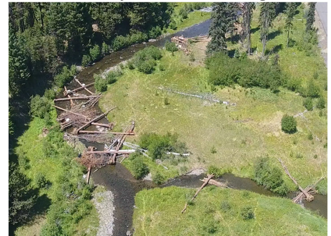
Alluvial wood debris and complexity structures