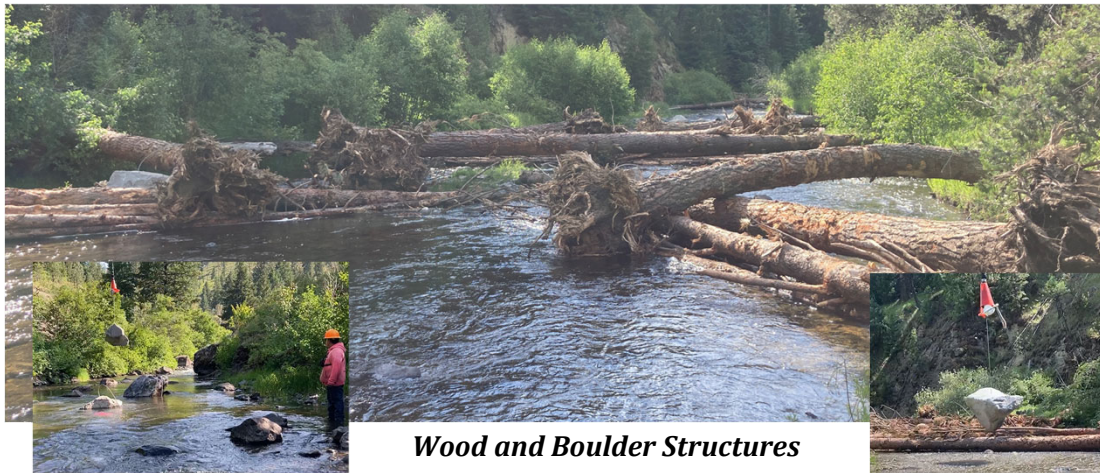
Wood and Boulder Structures