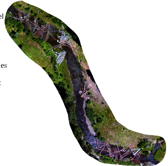
GRMW Post Project Ortho Mosaic Aug 2023

ESA ESU or DPS: Grande Ronde/Imnaha - Catherine Creek Spring/Summer Chinook, Upper Grande Ronde Steelhead.