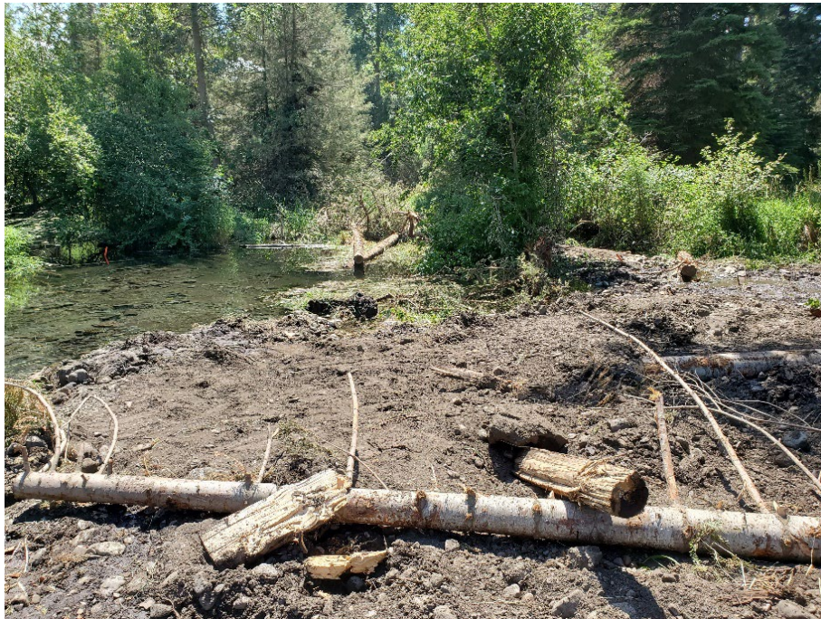
Figures 1 and 2. Top picture is the push up dam before removal, bottom picture is the push up dam removed also featuring large wood structure installation in channel and on floodplain.