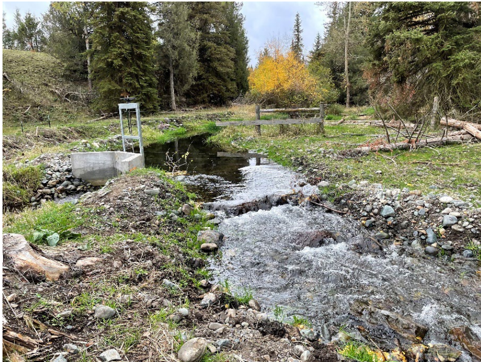
Figures 3 and 4. Top picture is looking downstream of completed roughened riffle and headgate installation. Bottom picture is looking upstream at completed roughened riffle and headgate.