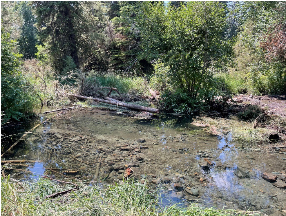
Figures 5 and 6. Top picture shows completed move and installation of turbine pump behind ODFW fish screen. Bottom picture shows completed large wood structure diverting flow to irrigation infrastructure, also shown is the high flow channel behind the structure in the pool where the debris dam use to be