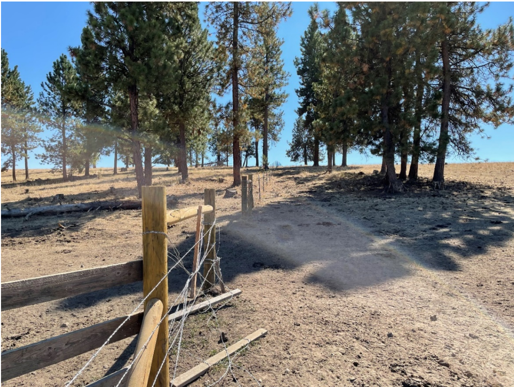
Figures 3 and 4. Another view of installed stock tanks and pasture division fence.