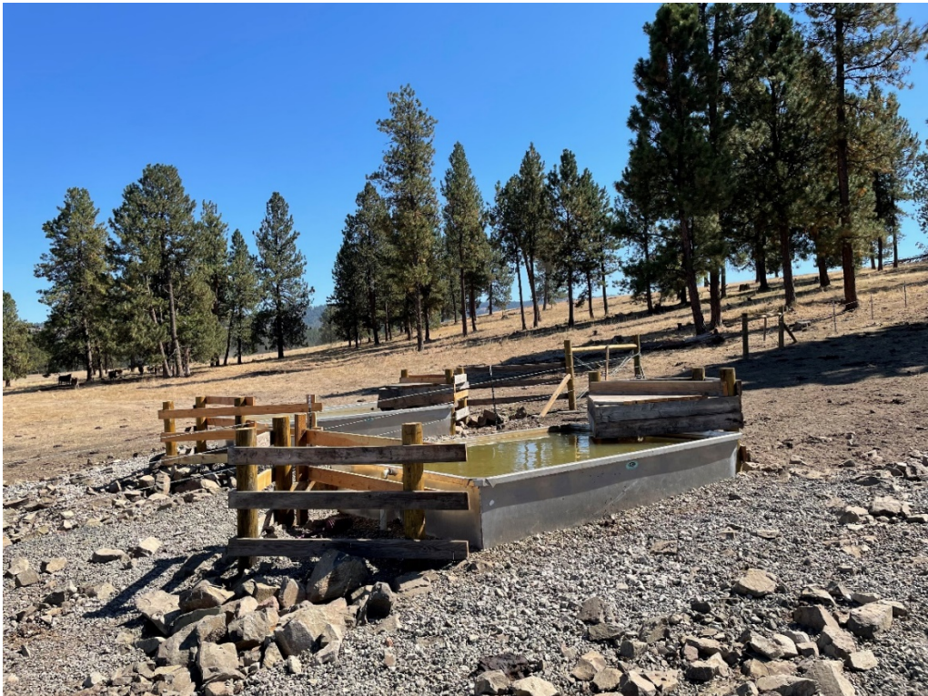
Figures 1 and 2. The installed cistern, stock tanks, and the pasture division fence.