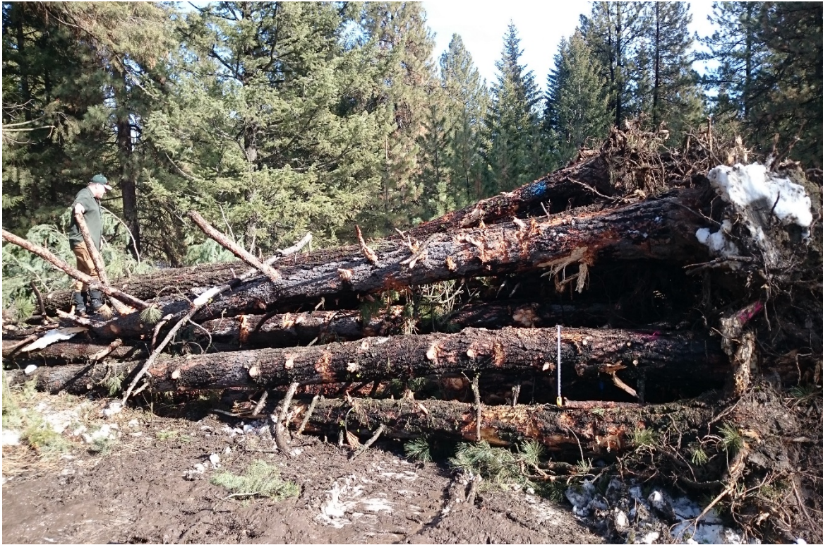
Trees harvested for use at the Wallowa-Baker Habitat Restoration Project, February 17, 2017.