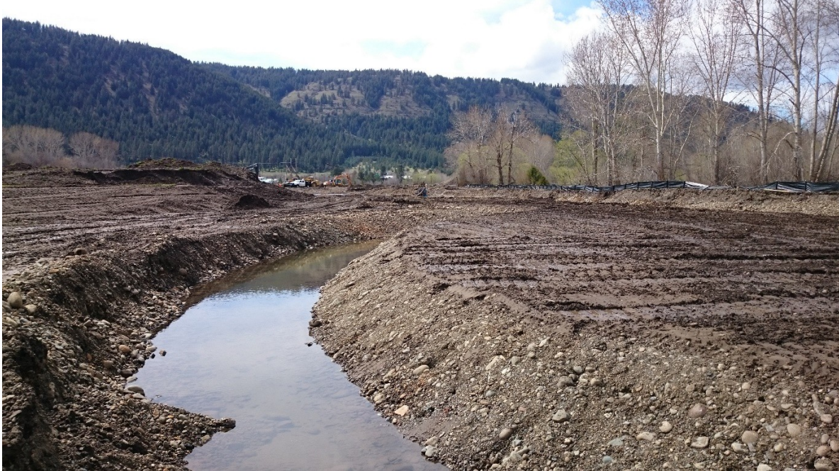
Figure 11. Floodplain and side channel construction at the Wallowa-Baker Habitat Restoration Project, April 12, 2017.