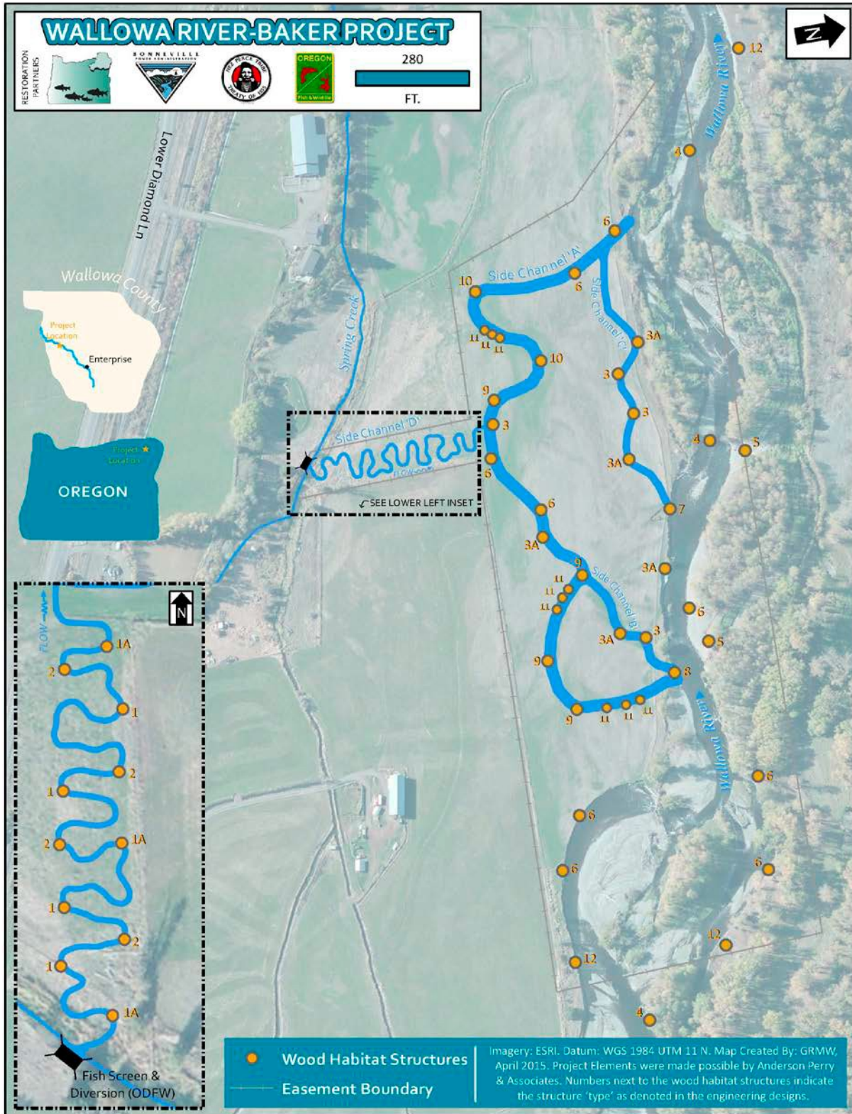
Figure 2. Wallowa-Baker Habitat Restoration Project. Phase 1 included side channels A, B and C and associated floodplain and habitat structures and seven mainstem habitat structures. Phase 2 includes side channel D and associated habitat structures, a fish screen and diversion device, and seven mainstem habitat structures.