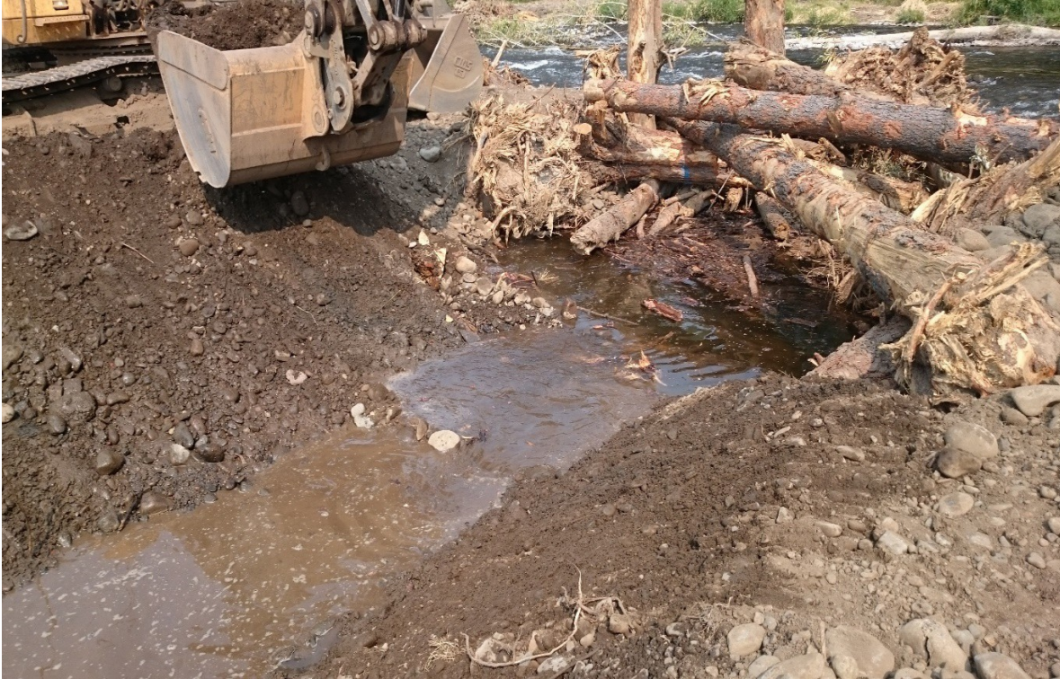
Figure 13. Connecting Wallowa-Baker Habitat Restoration Project Side Channel B to the Wallowa River, August 10, 2017.

Side channel C is also activated at 50% exceedance in the Wallowa River. Side Channel C is 924 feet long, with a sinuosity of 1.2, a width to depth ratio of 12, and contains four 5-foot deep pools. Flow will be 75 cfs with a water depth of 2.2 feet at OHW in the Wallowa River. A 25-member habitat and intake structure, designed to take the full brunt of the Wallowa River, was constructed at the mouth. Based on the Wallowa River Annual Hydrograph below Water Canyon, Side Channels B and C are expected to be active annually March-July and intermittently in January, February, October, November, and December, based on water year.