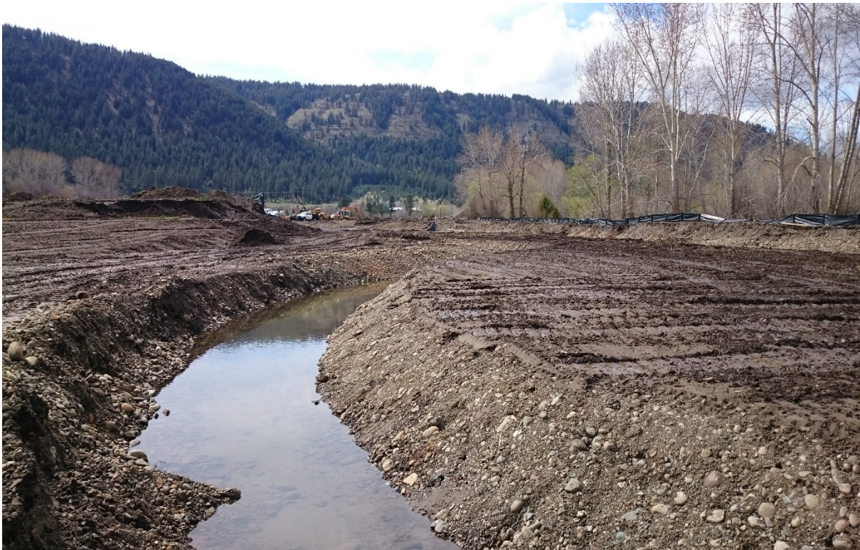
Floodplain and side channel construction at the Wallowa-Baker Habitat Restoration Project, April 20, 2017.