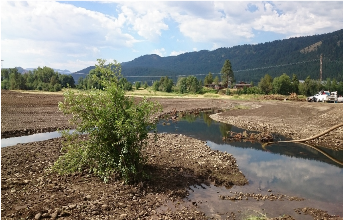
Groundwater in side channels A and C, constructed for the Wallowa-Baker project, July 18, 2017.