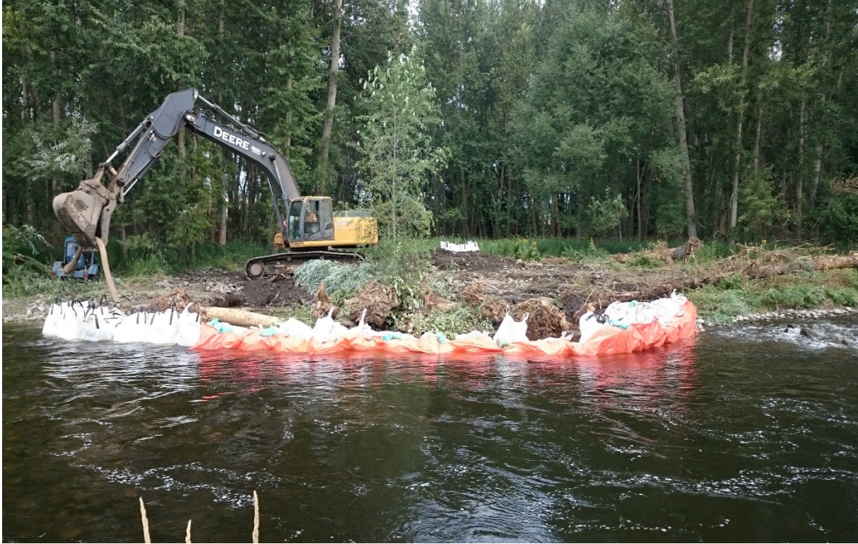
Construction of Wallowa-Baker Habitat Restoration Project mainstem habitat structure 6, on the right bank of the Wallowa River, July 26, 2017.