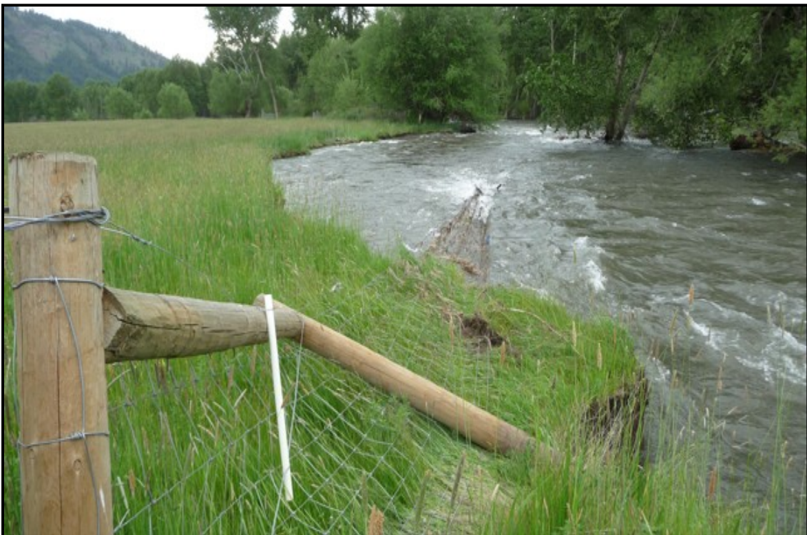
Figure 4. Looking downstream from the Baker property, June 2, 2009. The Wallowa River is shown laterally migrating through the narrow riparian buffer, carving what would become the main channel by the end of runoff.