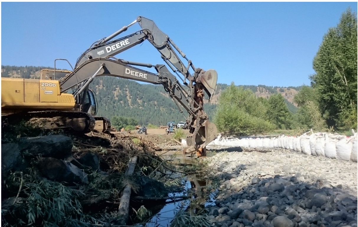
Construction of Wallowa-Baker Habitat Restoration Project mainstem habitat structure 8, at the inlet of Side Channels A and B, July 31, 2017.