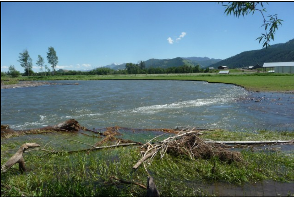
Figure 6. Looking upstream from the left bank of the Baker property (July 2010). Looking towards the locations of Figures 4 and 5. The bank is over 500 feet long.