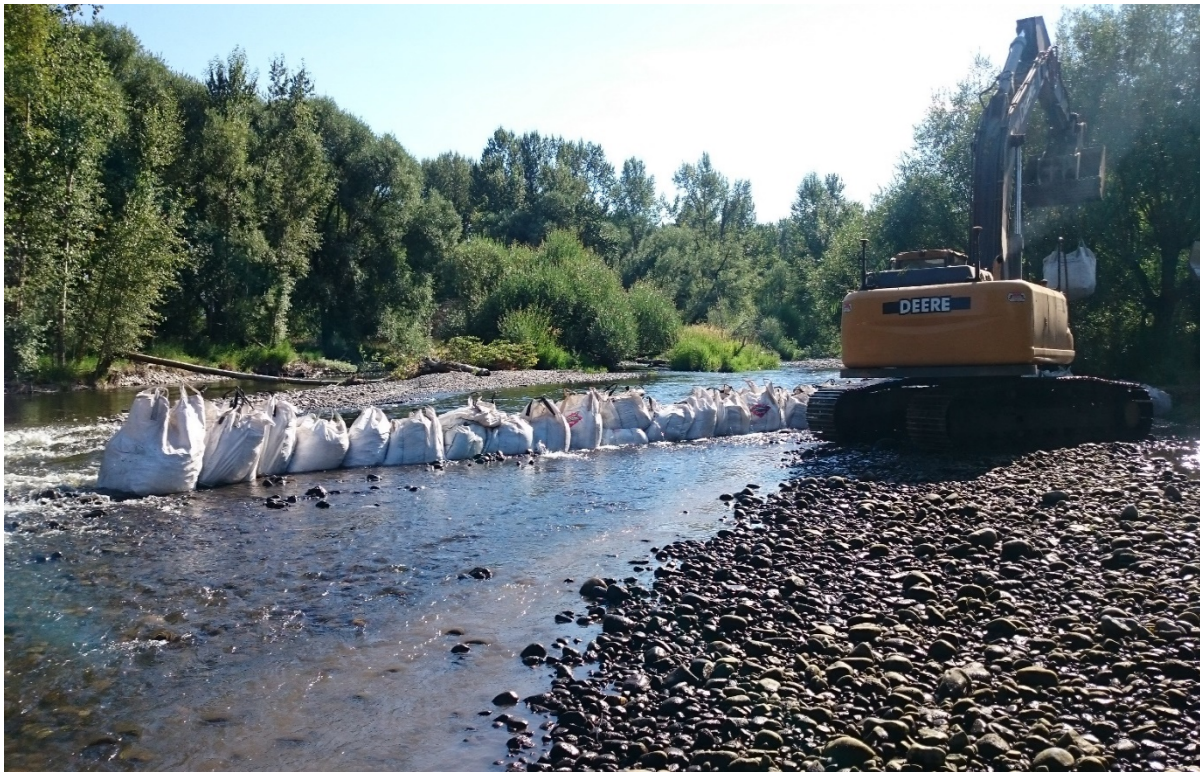
Isolation for construction of Wallowa-Baker Habitat Restoration Project mainstem habitat structure 8, at the inlet of Side Channels A and B, July 27, 2017.