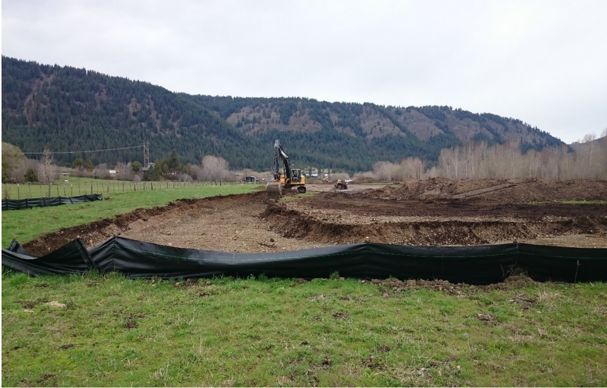
Floodplain and side channel construction at the Wallowa-Baker Habitat Restoration Project, April 12, 2017.