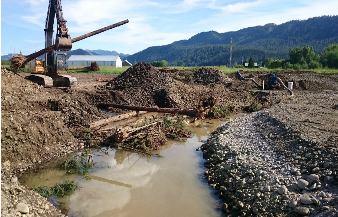
Figure 15. Construction of Wallowa-Baker Habitat Restoration Project Side Chanel A habitat structure 11, May 30, 2017.