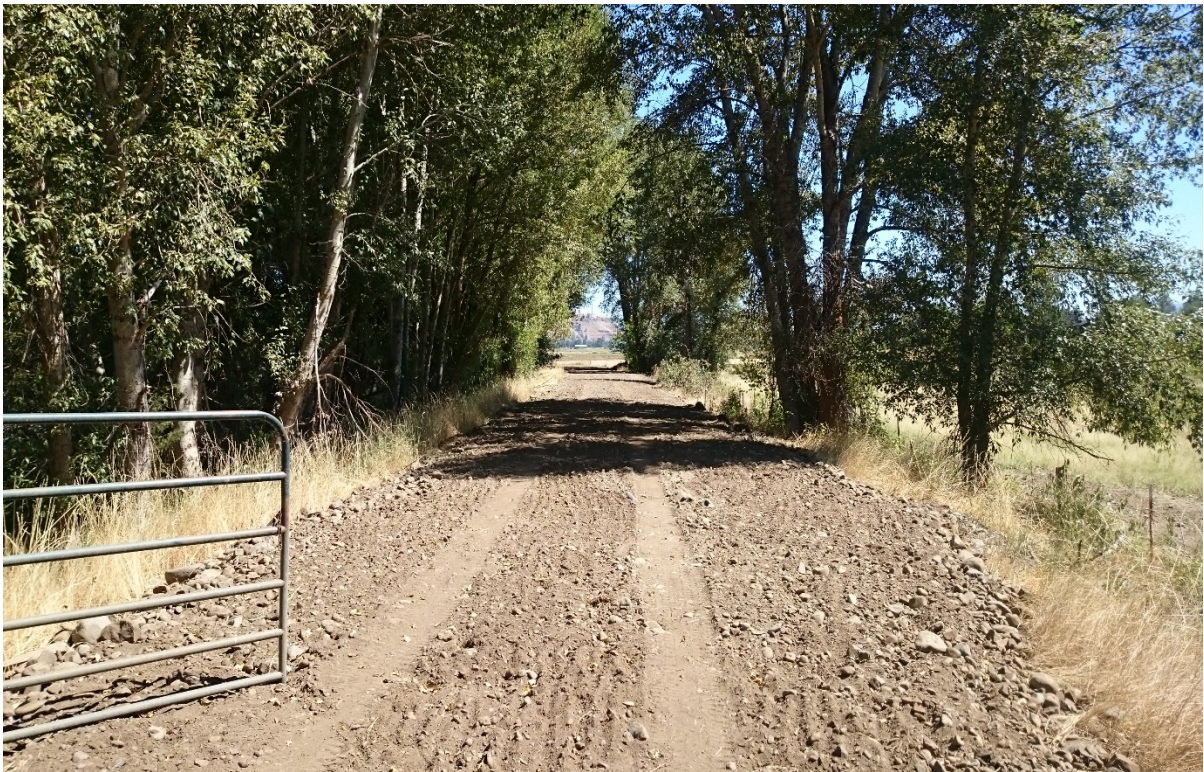
Access road to Wallowa-Baker Habitat Restoration Project regarded to original elevation following project construction in 2017.