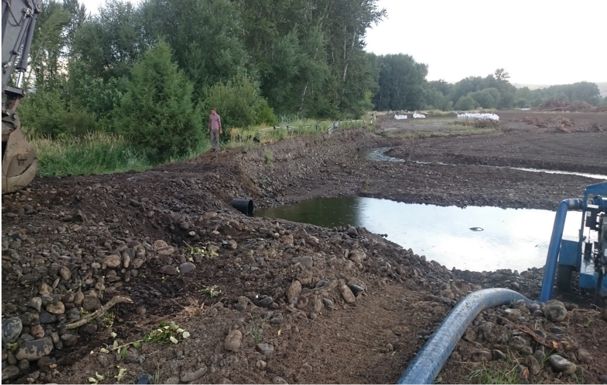
Groundwater removal from Wallowa-Baker Habitat Restoration Project Side Channel A, July 14, 2017.