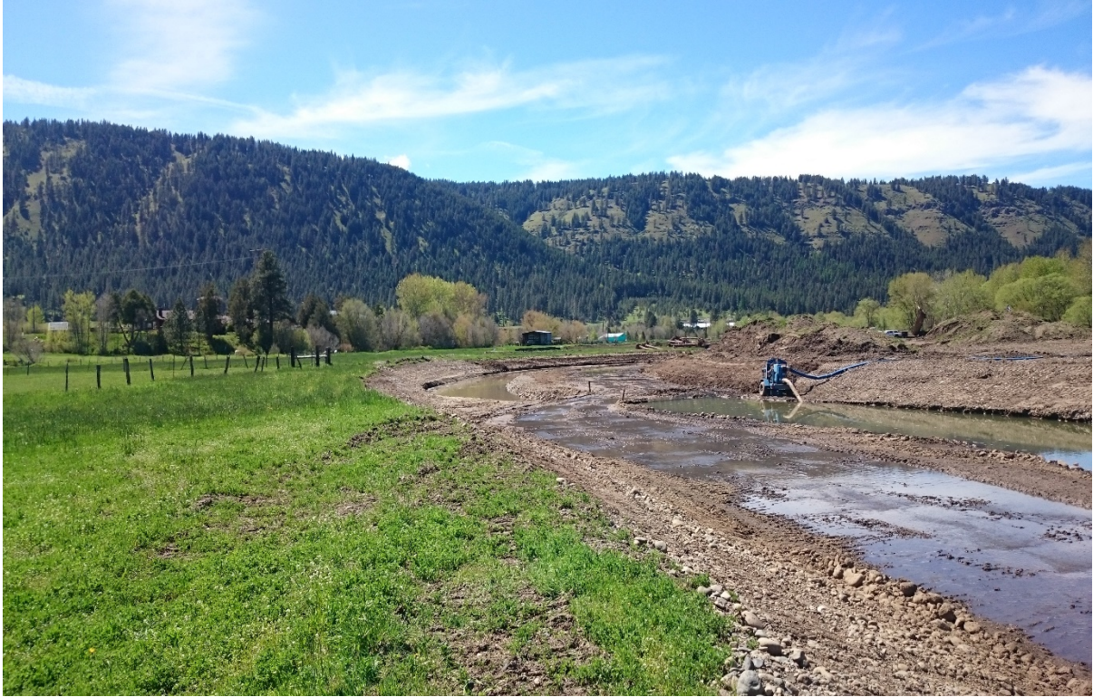
Floodplain and side channel construction at the Wallowa-Baker Habitat Restoration Project, May 04, 2017.