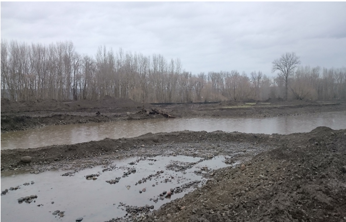
Floodplain construction at the Wallowa-Baker Habitat Restoration Project, March 15, 2017.