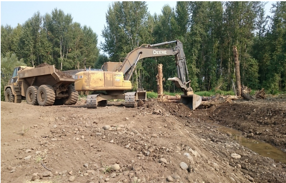
Figure 12. Connecting Wallowa-Baker Habitat Restoration Project Side Channel A to the Wallowa River, August 09, 2017.