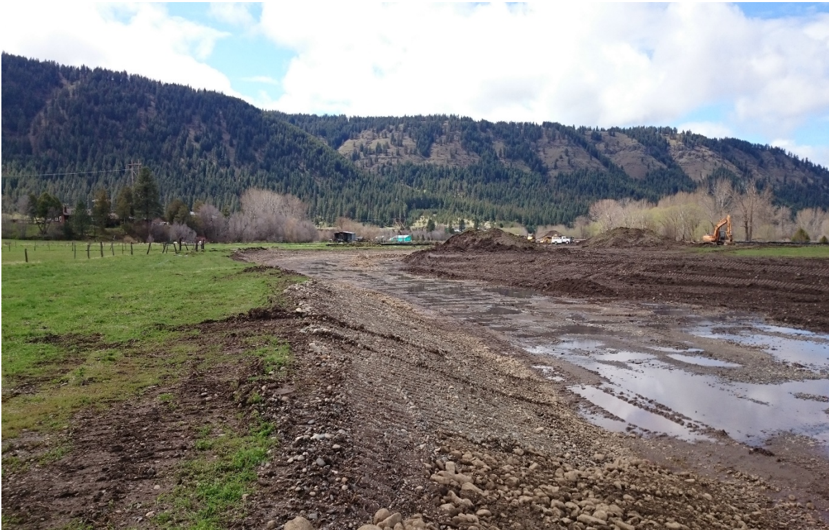
Floodplain construction at the Wallowa-Baker Habitat Restoration Project, April 18, 2017.