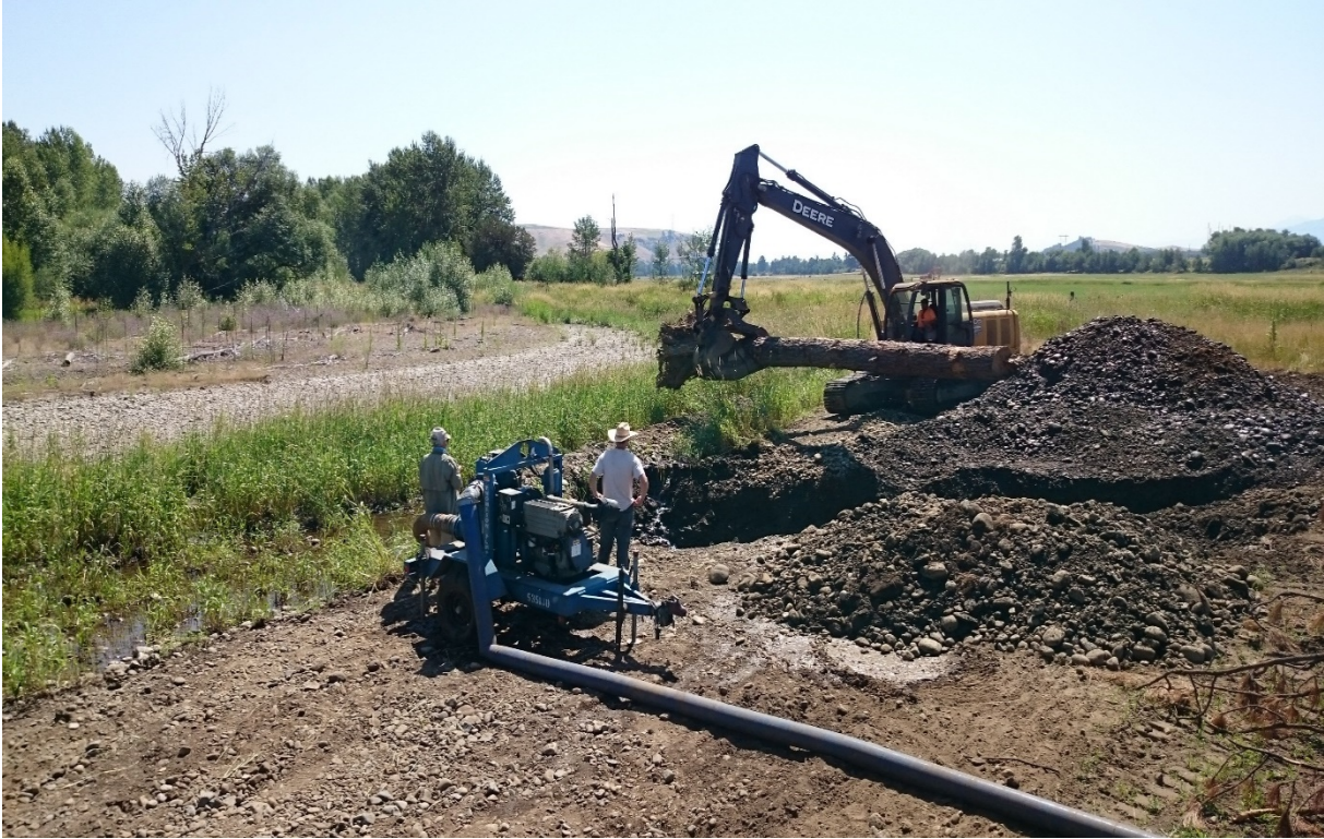
Construction of Wallowa-Baker Habitat Restoration Project mainstem habitat structure 6, July 18, 2017.