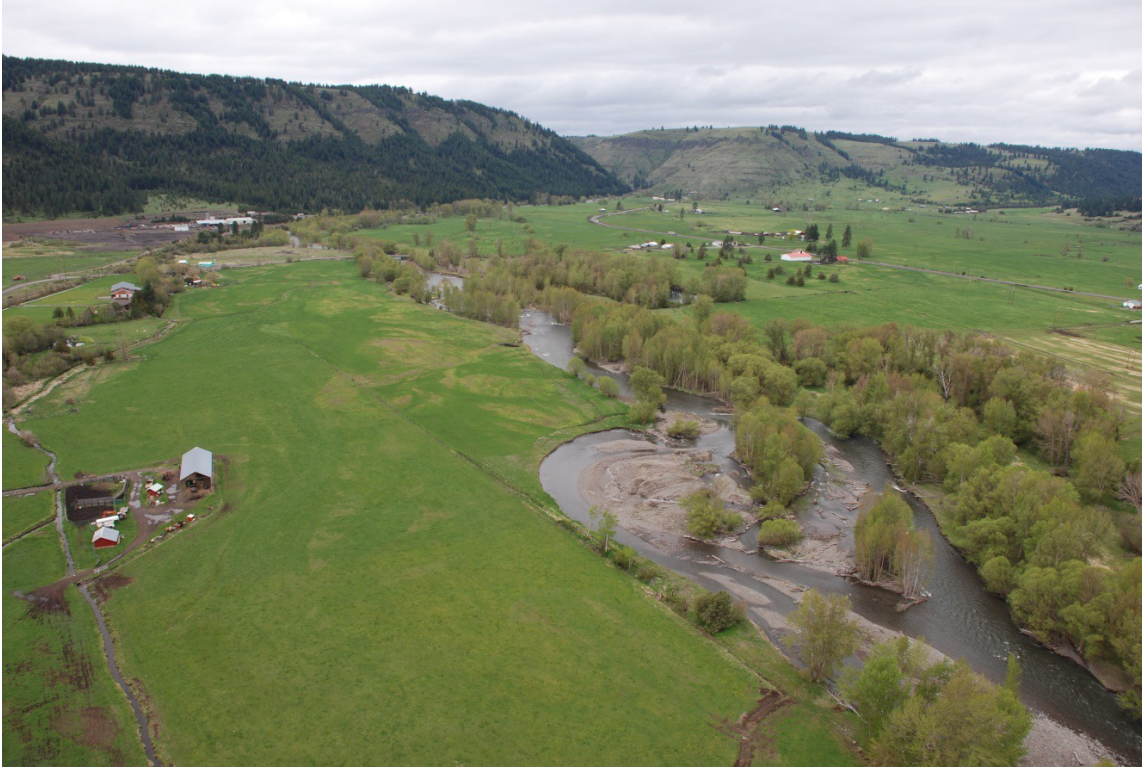
Figure 9. Aerial photo of Wallowa-Baker Project looking downstream, 2012. New channel carved on right bank and left bank channel now only activated at high flows.

Discussions were initiated with the landowner regarding a side channel creation and bank stabilization project in 2009. The project scope and concept developed by ODFW were approved by the landowners in 2013. Technical assistance and design funding was secured from BPA and the OWEB in 2014. Project design was completed in 2016. Phase 1 of the restoration project was completed in 2017.