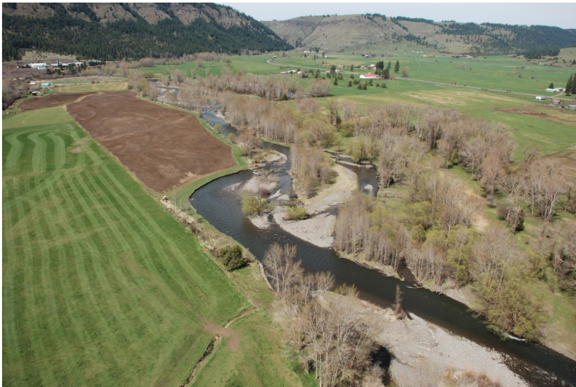
Figure 8. Aerial photo of Wallowa-Baker Project location looking downstream, 2010.