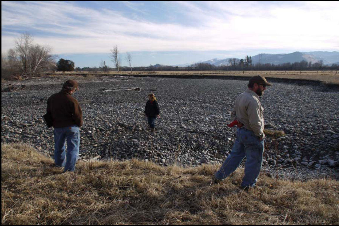
Figure 7. ODFW employees and the landowners surveying the abandoned left bank channel. This was the main channel in 2009-2012, and still activates at higher flows. Photo is taken from a location in proximity to the photo in Figure 6 (January 2012).