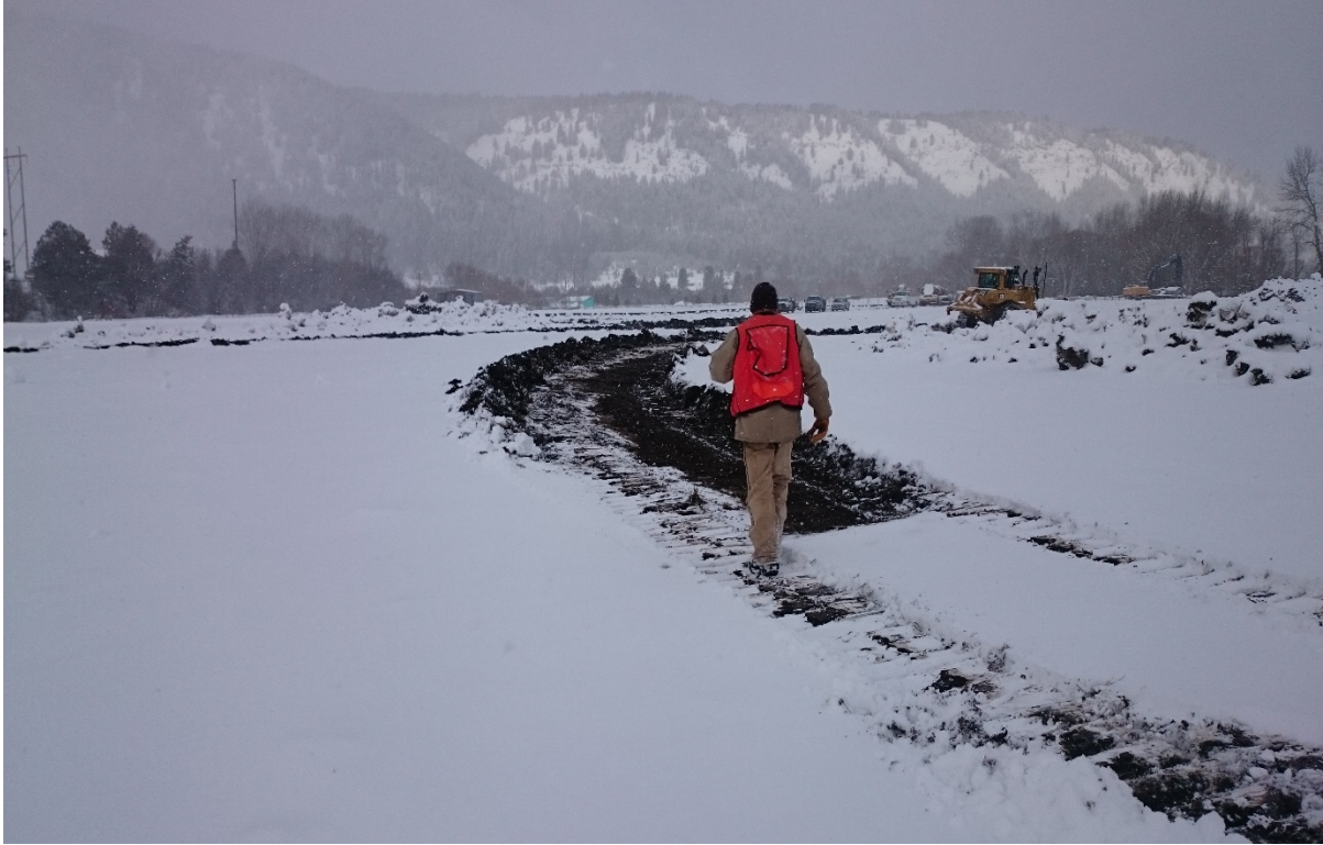
Floodplain Cutting at the Wallowa-Baker Habitat Restoration Project, February 28, 2017.