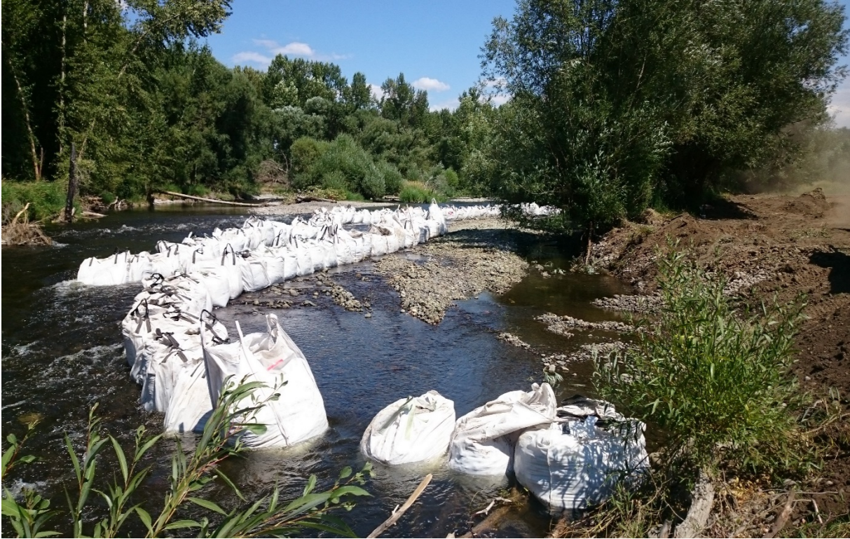
Isolation for construction of Wallowa-Baker Habitat Restoration Project mainstem habitat structure 8, at the inlet of Side Channels A and B, July 27, 2017.