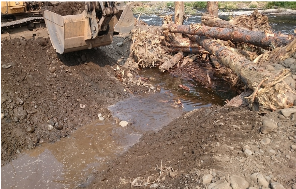
Connecting Wallowa-Baker Habitat Restoration Project Side Channel A to the Wallowa River, August 09, 2017