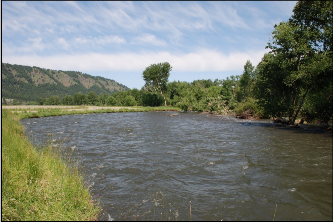
Figure 5. Looking downstream at the Wallowa River from the Baker Property, June 25, 2009. Location is close to Figure 4. As flows receded, this became the main channel.