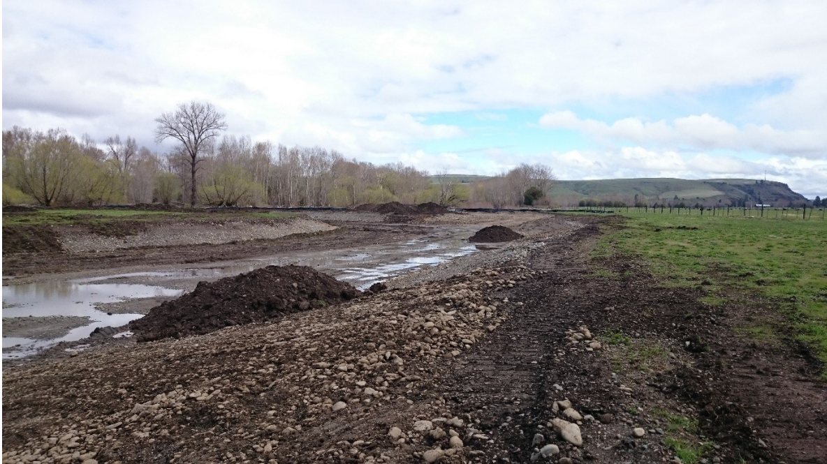
Figure 14. Floodplain constructed at the Wallowa-Baker Habitat Restoration Project, March 31, 2017.

These structures were installed at specific locations throughout the project reach to 1) increase habitat complexity; 2) promote pool development and maintenance; 3) provide cover; 4) promote sediment sorting; 5) provide margin roughness; 6) decrease riffle lengths and width to depth ratios; 7) promote localized scour; 8) provide bank stabilization; 9) control side channel inlets from excessive scour and sedimentation; and 10) provide mainstem and side channel maintenance and desired configuration. Engineered wood and habitat structures installed on the mainstem Wallowa River are comprised of 113 logs and trees as members and 45 logs as racking material. Habitat structures constructed in side channels are comprised of 167 logs and trees as members and 77 logs as racking material.