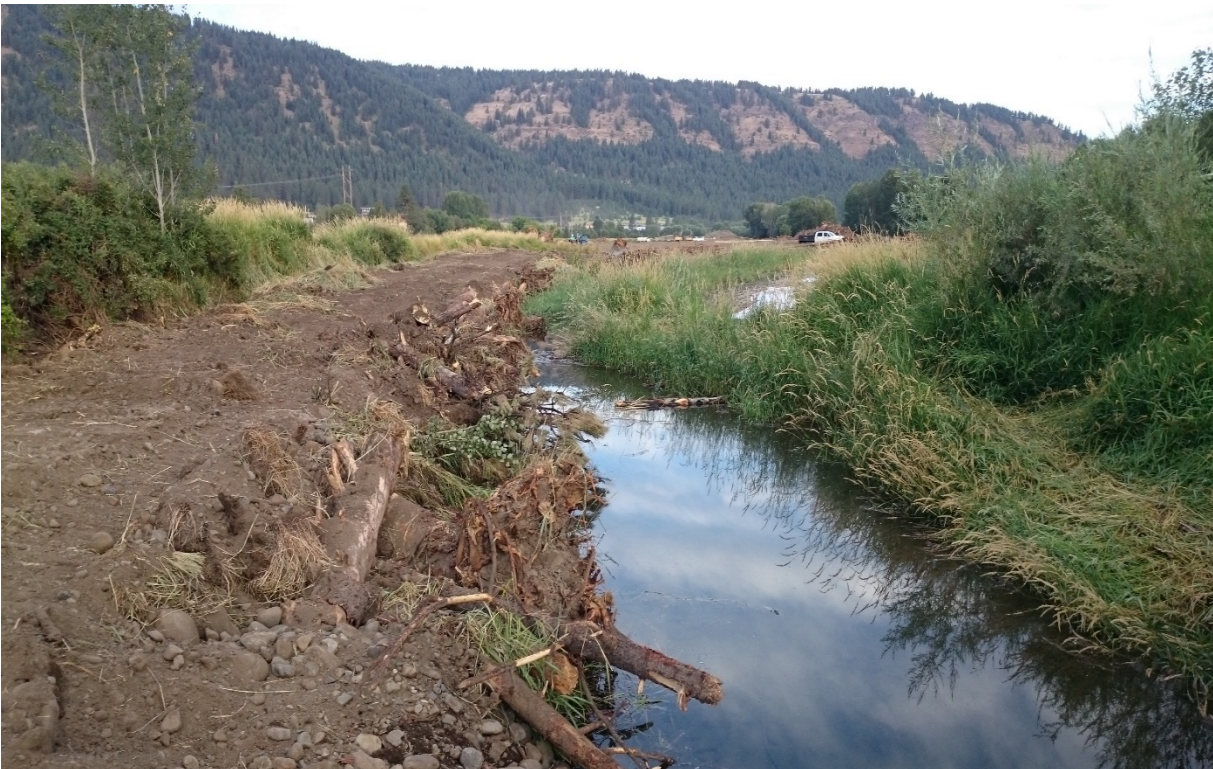
Mainstem habitat structure 12, at the upstream end of the Wallowa-Baker project, July 24, 2017.