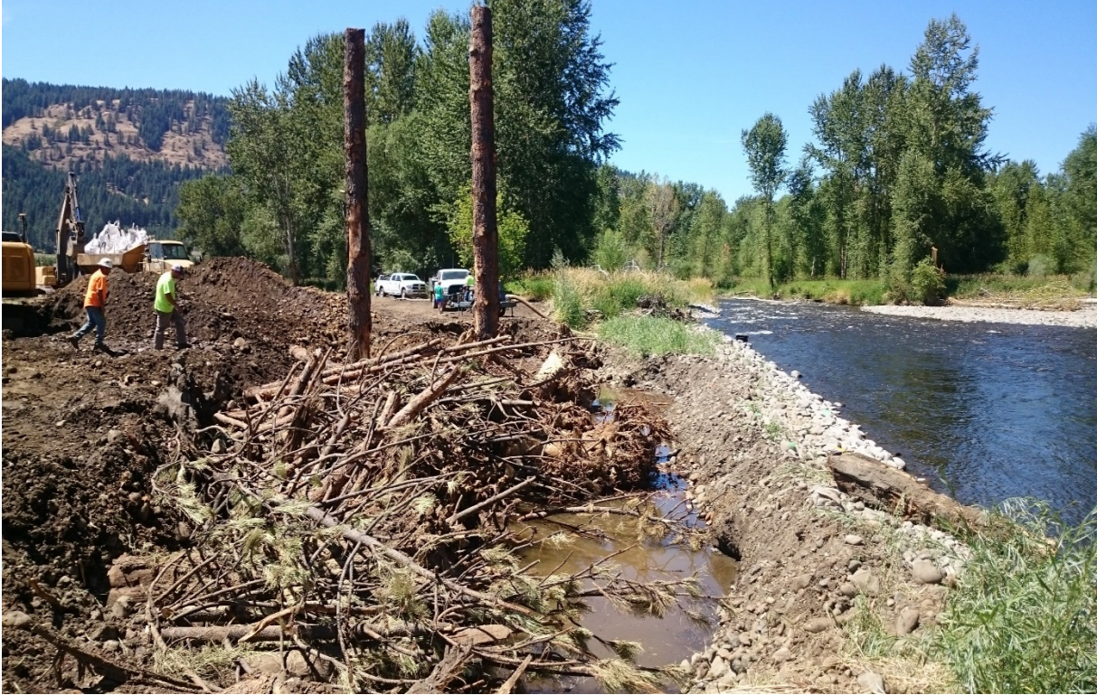
Wallowa-Baker Habitat Restoration Project mainstem habitat structure 7, at the inlet of Side Channel C, July 26, 2017.