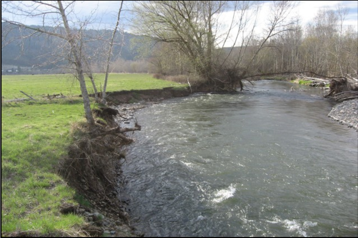
Figure 3. Looking downstream from the Baker property at the localized bank erosion, April 2007.