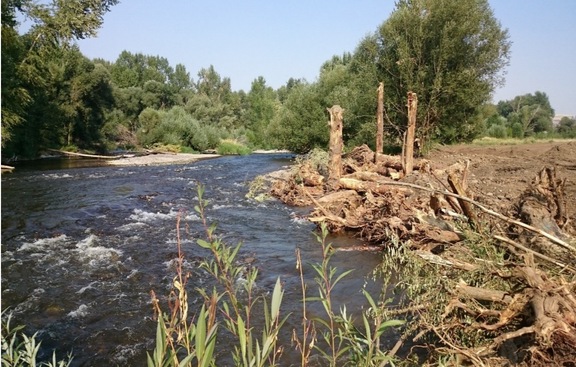
Figure 17. Wallowa-Baker Habitat Restoration mainstem habitat structure 8, at the inlet of Side Channels A and B, August 02, 2017.