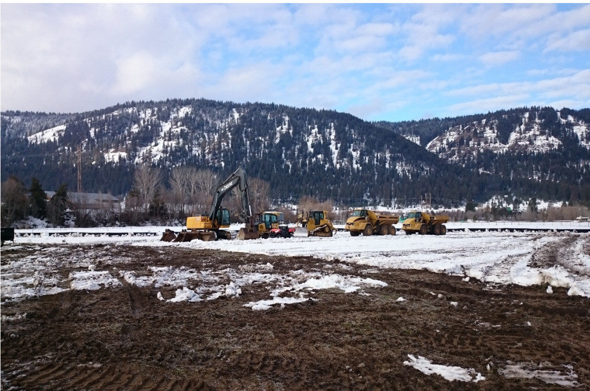
Initiation of Wallowa-Baker Habitat Restoration Project construction, February 24, 2017.