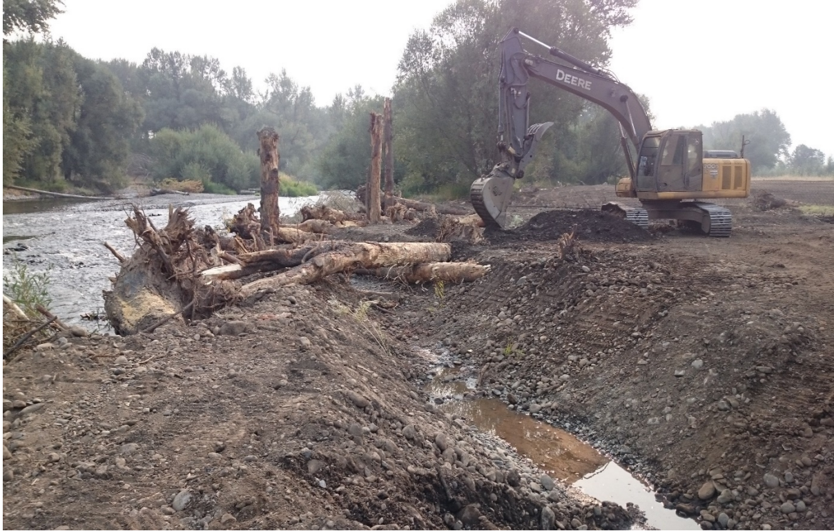
Connecting Wallowa-Baker Habitat Restoration Project Side Channel B to the Wallowa River, August 10, 2017.