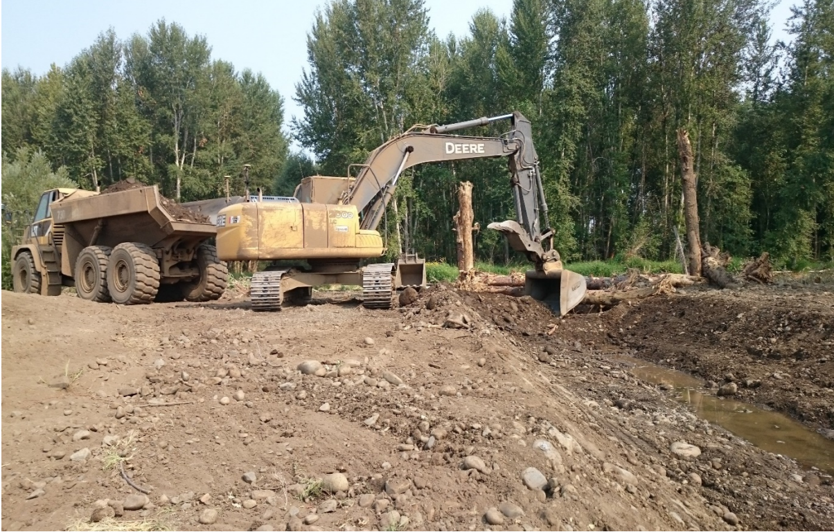
Connecting Wallowa-Baker Habitat Restoration Project Side Channel A to the Wallowa River, August 09, 2017.