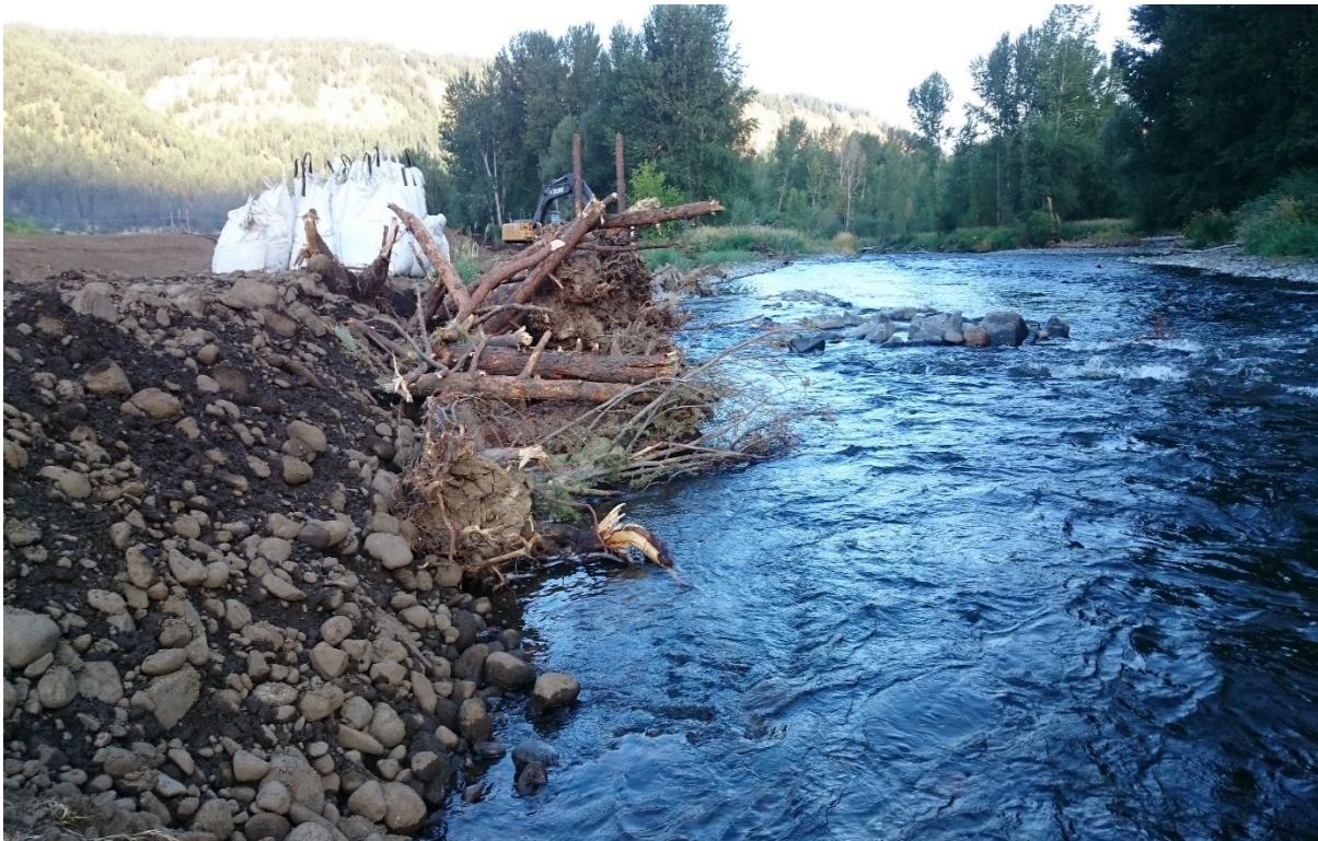
Wallowa-Baker Habitat Restoration Project mainstem habitat structure 3A, upstream of the inlet of Side Channel C, July 27, 2017.