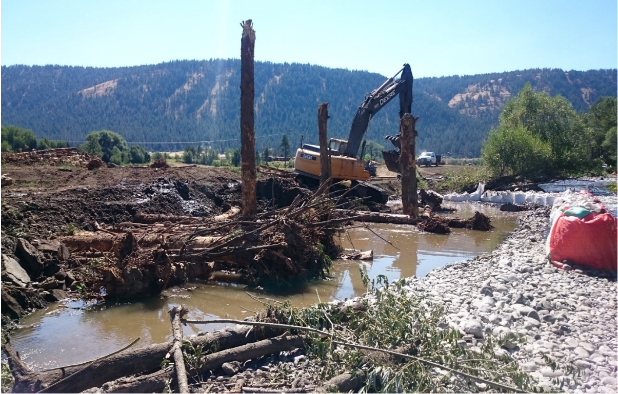
Construction of mainstem habitat structure 8 at the inlet of Side Channels A and B, August 01, 2017.