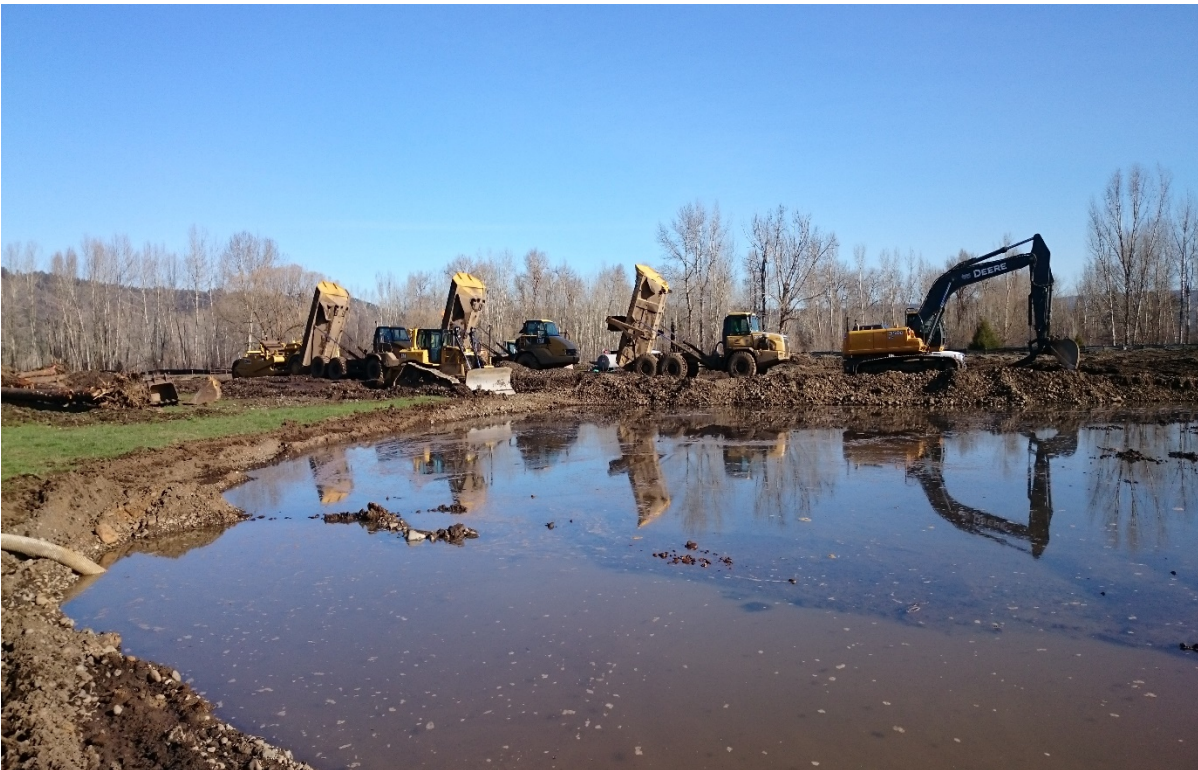
Floodplain and side channel construction at the Wallowa-Baker Habitat Restoration Project, March 31, 2017.