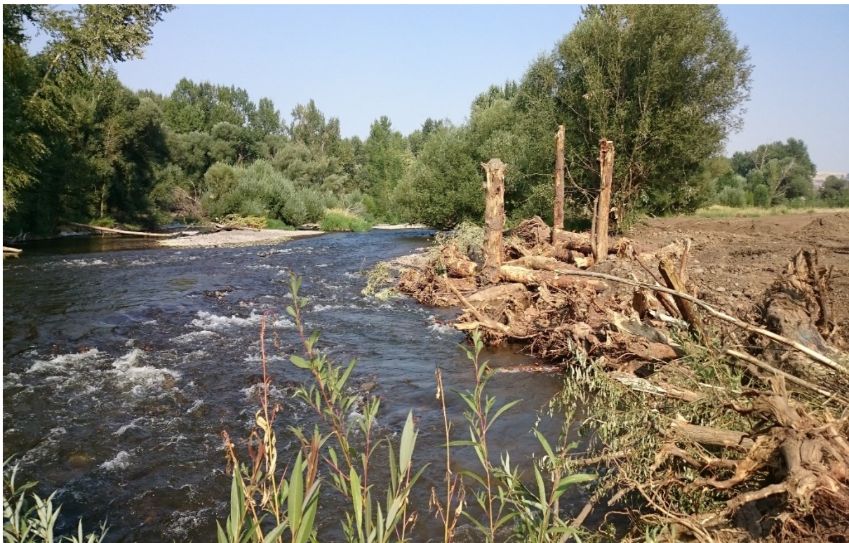
Wallowa-Baker Habitat Restoration mainstem habitat structure 8 at the inlet of Side Channels A and B, August 02, 2017.