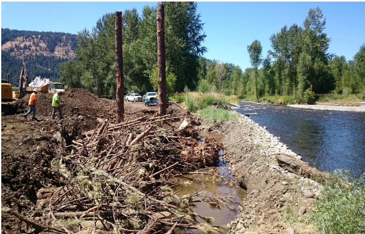
Figure 18. Wallowa-Baker Habitat Restoration Project mainstem habitat structure 7, at the inlet of Side Channel C, July 26, 2017.