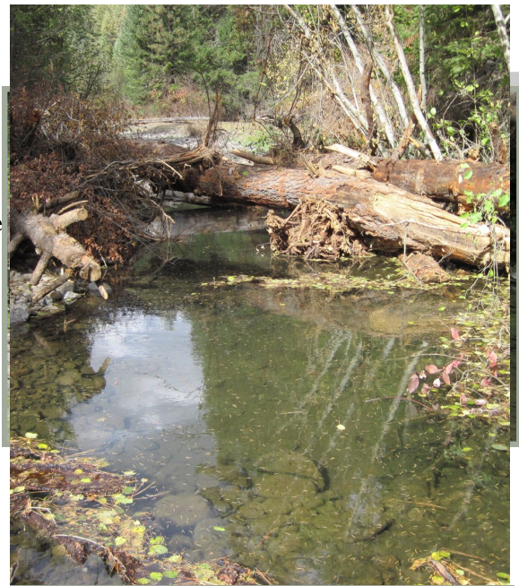
Completed structure on Five Points.

An old diversion structure constructed in the late 1920s by the railroad for stream engines was located in lower Five Points Creek. It was a passage barrier for some or all of the life stages of summer steelhead, spring/summer chinook and bull trout.