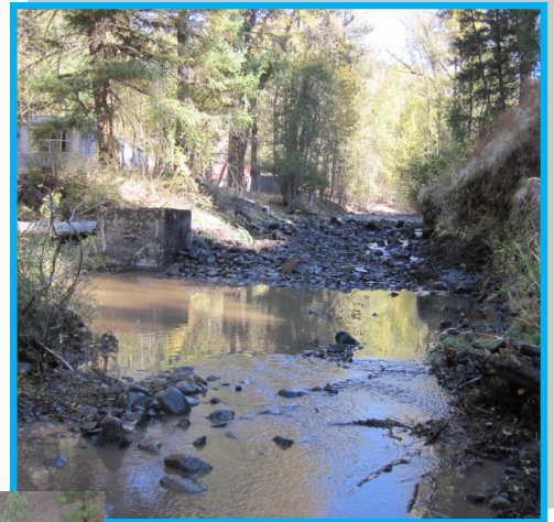
Post barrier removal.