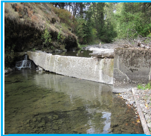
Barrier prior to removal.