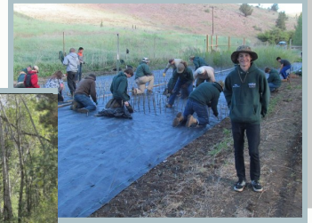
Planting cuttings at Clarno, OR for Five Points.

Restoration work completed in 2015/2016 included fish barrier removal, wood haul, fish structure construction, planting, and ATV road closure/obliteration.