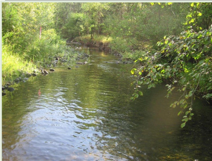
Structure #6 Post Restoration with new beaver activity —>