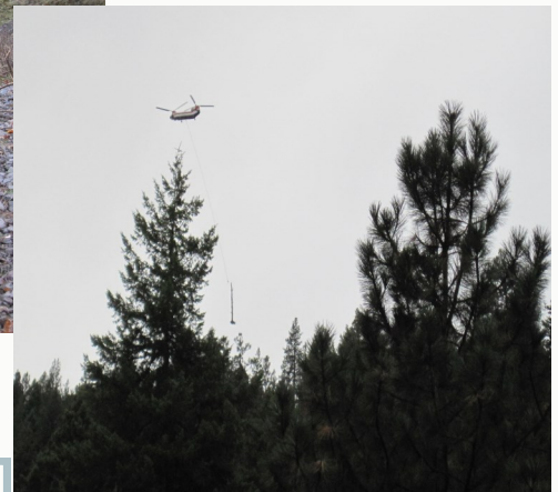
Flying in Large Wood.