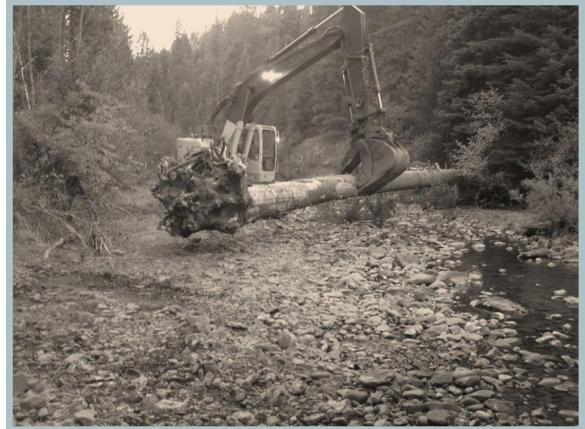
Fish Structure Construction.

Historic timber harvest, rail road grade and roading removed larger conifers from the valley bottom, reducing the future recruitment of large wood to the stream. Historic grazing has caused impacts to the riparian area.